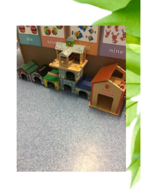
Train up a child in the way he should go: and when he is old, he will not depart from it. Proverbs 22:6